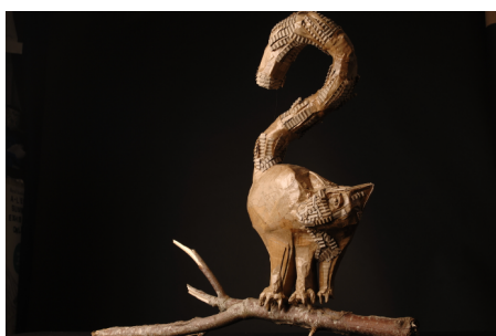
Ring-Tailed Lemur Ellie, Age 16

I really like maps and geography. A while ago I created an imaginary country called Yay. I drew lots of maps of this country and changed it as I got new ideas. This map is of the main island of Yay, called Vazuliland. I got my inspiration from looking at real maps but I use my own style.